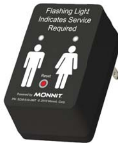
Notification Unit Dimensions (3 in. x 2 in. x 2 in.)