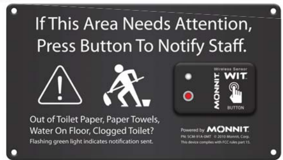
Restroom Wall Plate